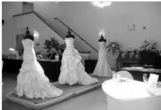
The first annual Newburyport Bridal Showcase was held on November 9th at The Phoenix Room and Nicholson Hall. The showcase featured over 40 bridal industry vendors and ended with a beautiful fashion show.