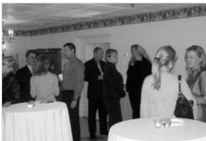
Members enjoyed a great night of networking at the November mixer hosted by Country Rehabilitation & Nursing Center in Newburyport.